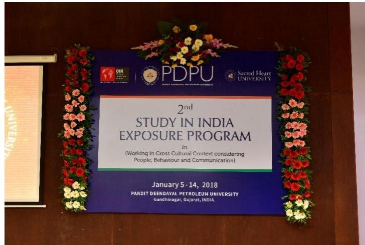
A glimpse from the valedictory session preparations