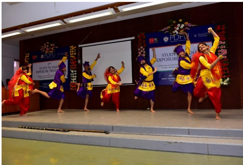
Cultural Dance Performances by PDPU Students