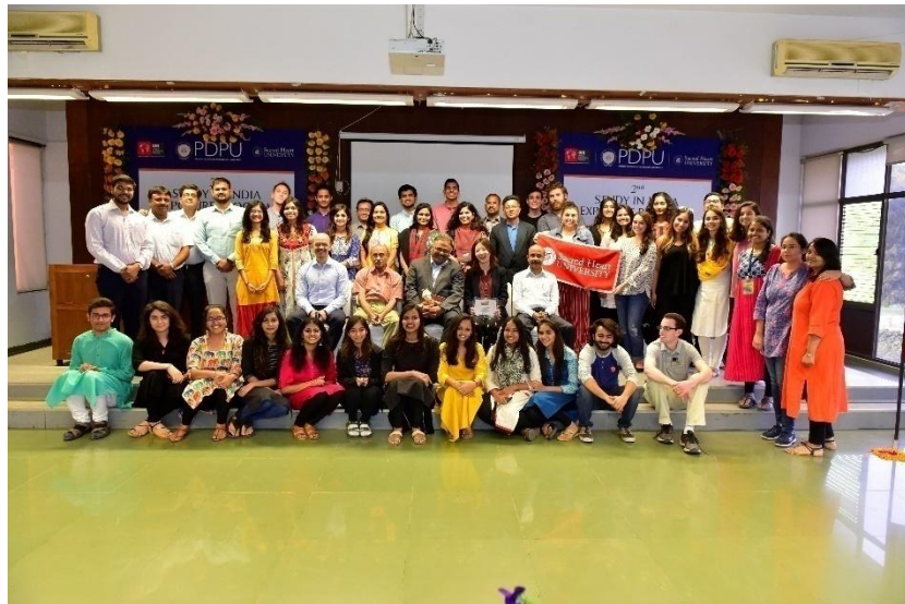
Group Picture: Esteemed dignitaries with the student delegation from SHU and student volunteers from PDRU