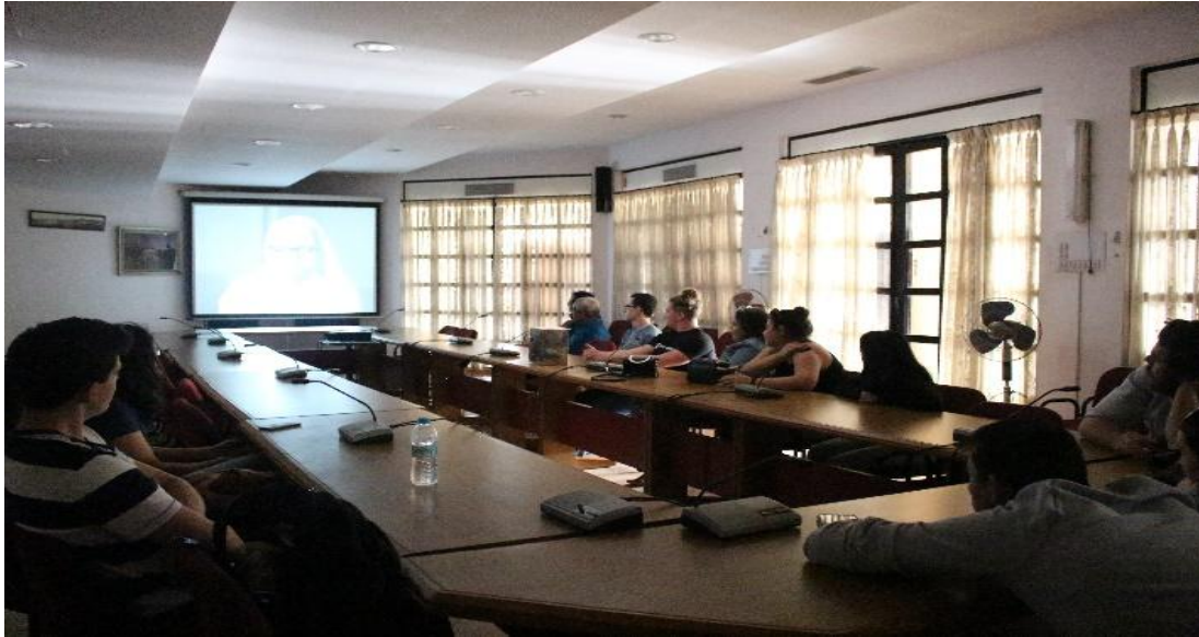
Distinguished Guest Talk on Indian Business structure and corporate culture of cooperatives; and a visit to AMUL Dairy and museum