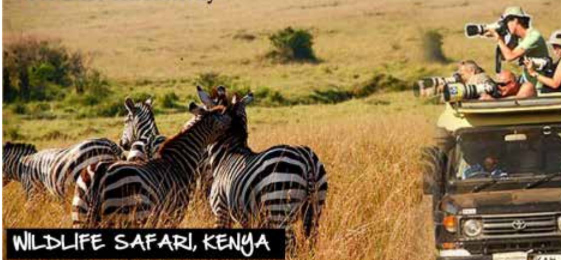
WILDLIFE SAFARI, KENYA

RESEARCH PROJECT: Energy is one of the main problems of the world so to contribute in avoiding it I worked on a project which is based on the transmitting wire which has 7.5% more conductivity