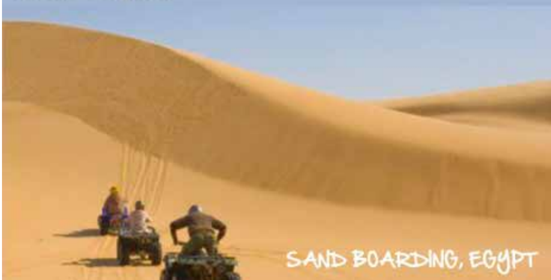
SAND BOARDING, EGYPT