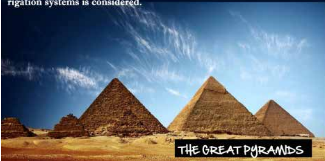
THE GREAT PYRAMIDS

WIND PUMP: This report examines the use of wind energy in agriculture and more specifically its application to small-scale irrigation. The technical, economic and institutional feasibility of Wind Pump irrigation systems is considered.