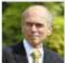
Janez Drnovsek President of Slovenia 2002-07