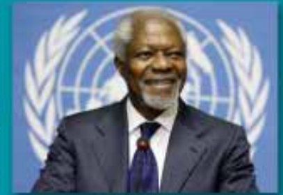
Kofi Annan Former Secretary General United Nations

“The United Nations has long recognized that the imagination, ideals and energies of young men and women are vital for the continuing development of the societies in which they live. Since its inception in 1948, AIESEC has contributed to this development by serving as an agent of positive change through education and cultural exchange. In an era of globalization, your programmes have helped young people around the world to develop a broader understanding of cultural, socio economic and business management issues.”