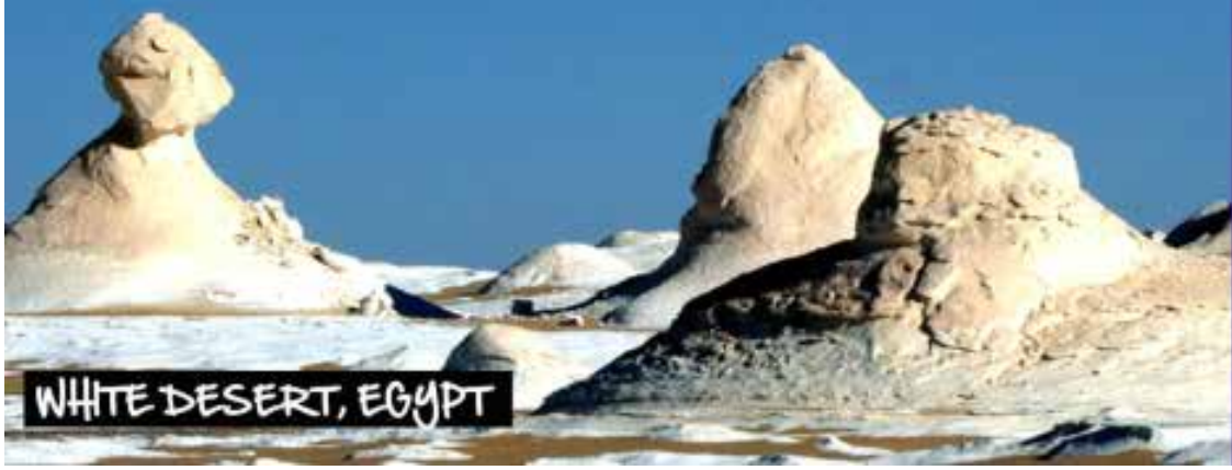
WHITE DESERT, EGYPT

Clean Technology in Textile Processing Industry -this paper focusses on environmental friendly technologies for processing of textile ."Clean technologies" are defined as "product technologies or manufacturing process that reduce pollution or waste, energy use or material use in comparison to the technologies that they replace. The textile industry should focus on these technologies to prevent pollution while reducing costs, material consumption or improved product quality.