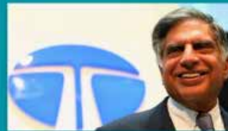
Ratan Tata Chairman, TATA Sons

“AIESEC has admirably met its objectives of providing students with the opportunity to interact with the business community internationally, thus giving them necessarily industrial exposure, so vital to their future careers. AIESEC in India members have played an important and commendable role in actively pursuing AIESEC’s objective in India.”