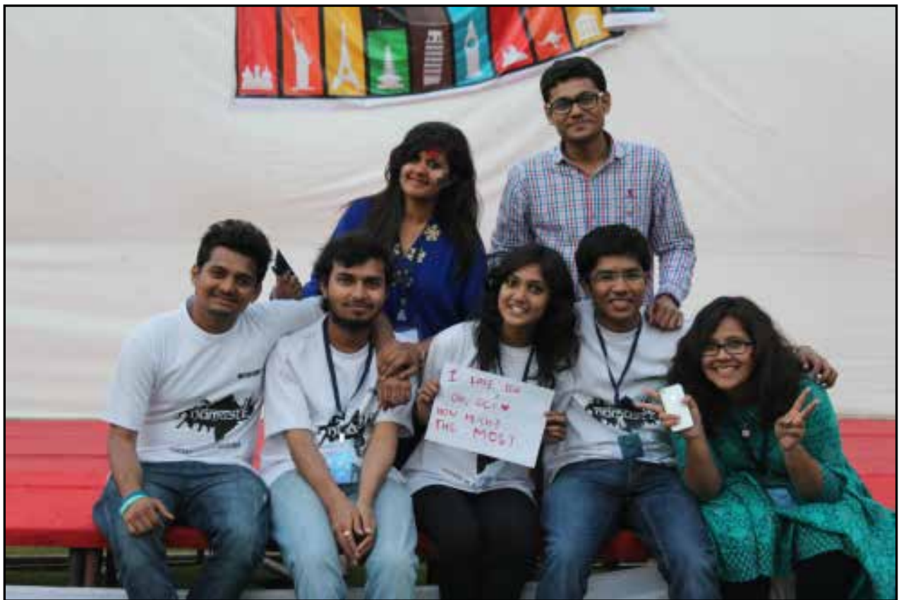
The CORE COMMITTEE OF Project NAMASTE

Project NAMASTE was one of a kind project hosted by PANDIT DEENDAYAL PETROLEUM UNIVERSITY . The credit for the execution of such a woberful project goes to the Core Committee, organizing committee, the students and administration staff of PANDIT DEENDAYAL PETROLEUM UNIVERSITY .